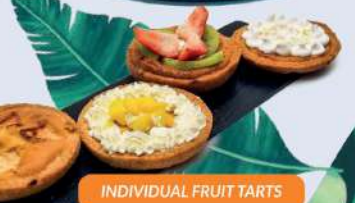
INDIVIDUAL FRUIT TARTS