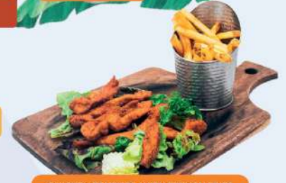
CHICKEN TENDERS WITH FRENCH FRIES