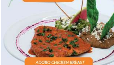
ADOBO CHICKEN BREAST