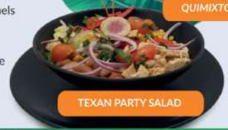
TEXAN PARTY SALAD