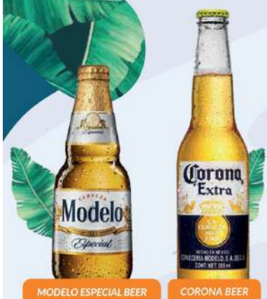
MODELO ESPECIAL BEER

"MI CASA ES SU CASA" "¡CON MUCHO GUSTO!"