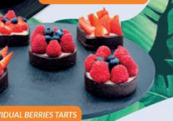
INDIVIDUAL BERRIES TARTS