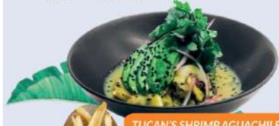
TUCAN'S SHRIMP AGUACHILE