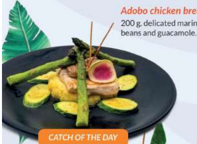
CATCH OF THE DAY